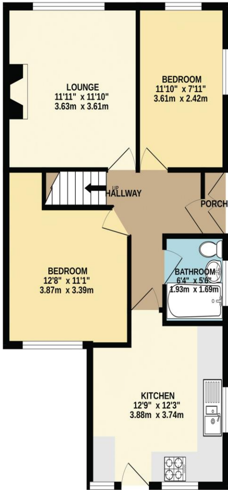
GROUND FLOOR 605 sq.ft. (56.2 sq.m.) approx.